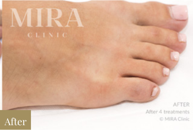
After 4 Enlighten treatments