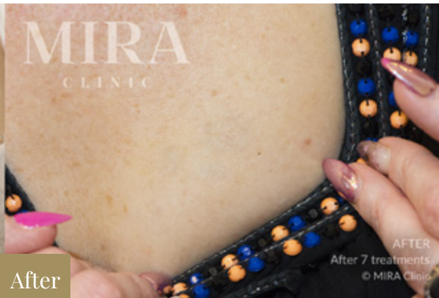
After 7 treatments