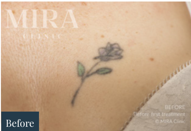
Before First Treatment