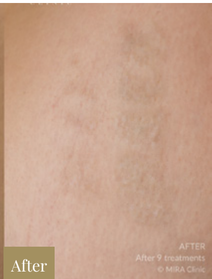
After 9 treatments