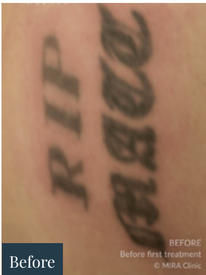
Before First Treatment