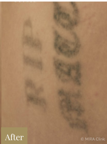
After First Treatment